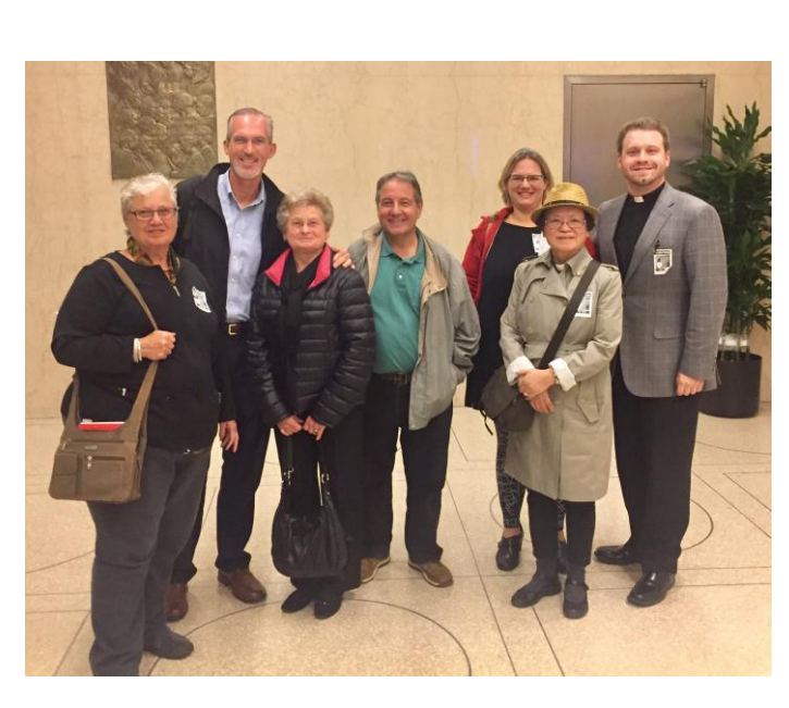
"Behold, I am doing a new thing! Now it springs forth; do you not perceive it?" Isaiah 43:19