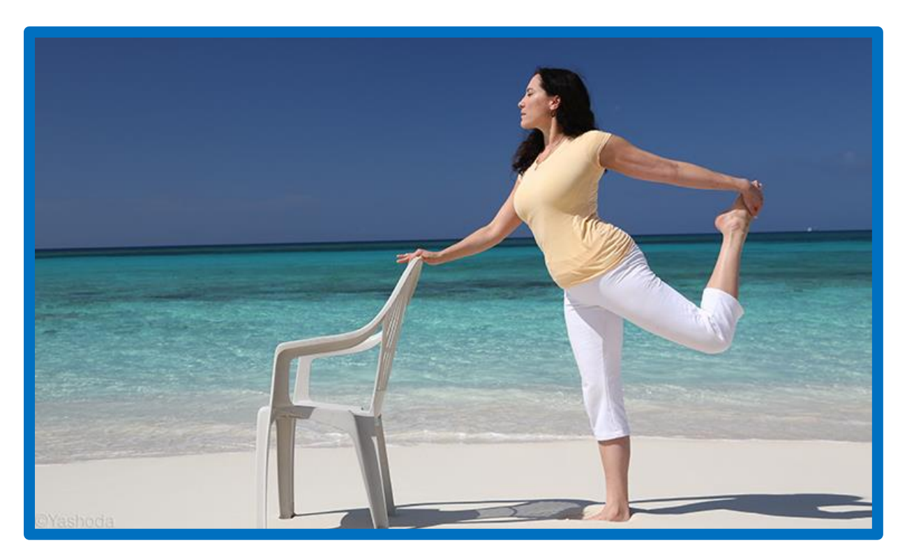
Yoga is for EVERY BODY!

Have you ever thought about trying yoga and told yourself that you CAN'T?