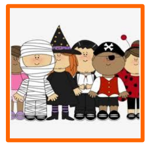
Wear your costumes

$10 per family includes pizza, games, dessert and trick-or-treating