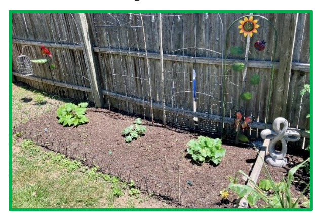
"The kiss of the sun for pardon, the song of the birds for mirth, one is nearer God's heart in a garden than anywhere else on earth."