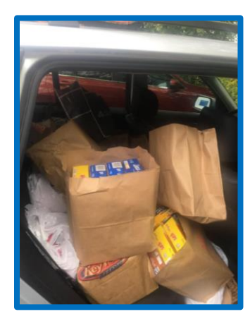
420 lbs of food collected!

Our Spring Food Drive for the New LIFE Center was a big success!